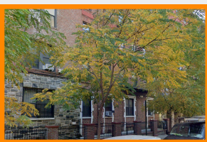
E 21 St