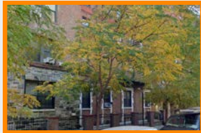
E 21 St