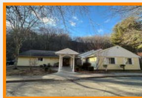
N Orange St

Interested in learning more about any of these vacancies?